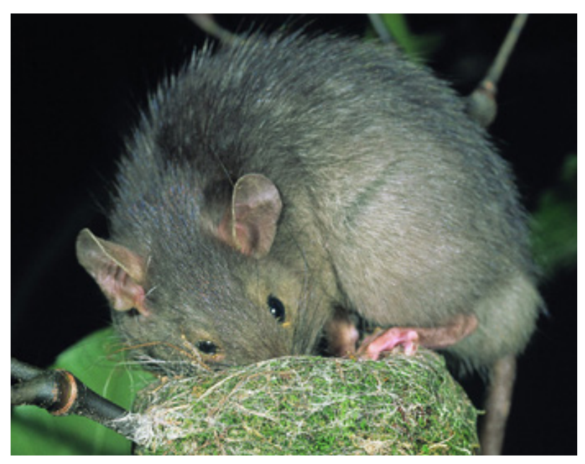
Ship rat in a fantail nest.

Climbing up to nests is easy for a ship rat and they like to hang out in trees. In ship rats the ears are large and the tail is longer than the body. Because they are such good climbers these rats are the biggest threat to birds, eggs and chicks. They also eat fruit and plants, competing with our birds for food. Ship rats are the most common and widespread species of rat found in New Zealand.