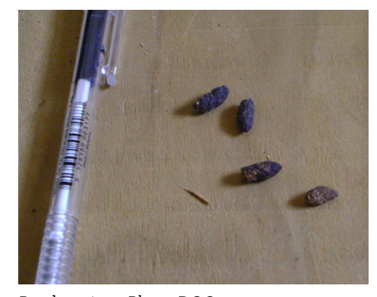
Rat droppings.