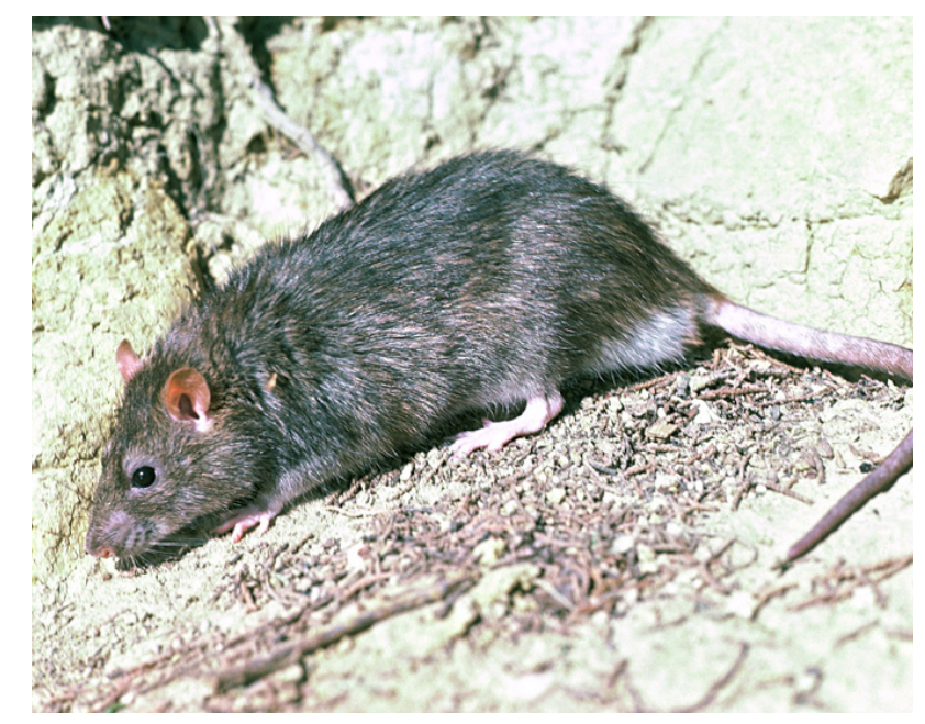
Norway rat.

Norway rats are the largest rats in New Zealand. In Norway rats the ears are small and the tail is shorter than the body. Norway rats spend more time on the ground, so will eat invertebrates like wētā, beetles, spiders and stick insects, ground nesting birds and lizards