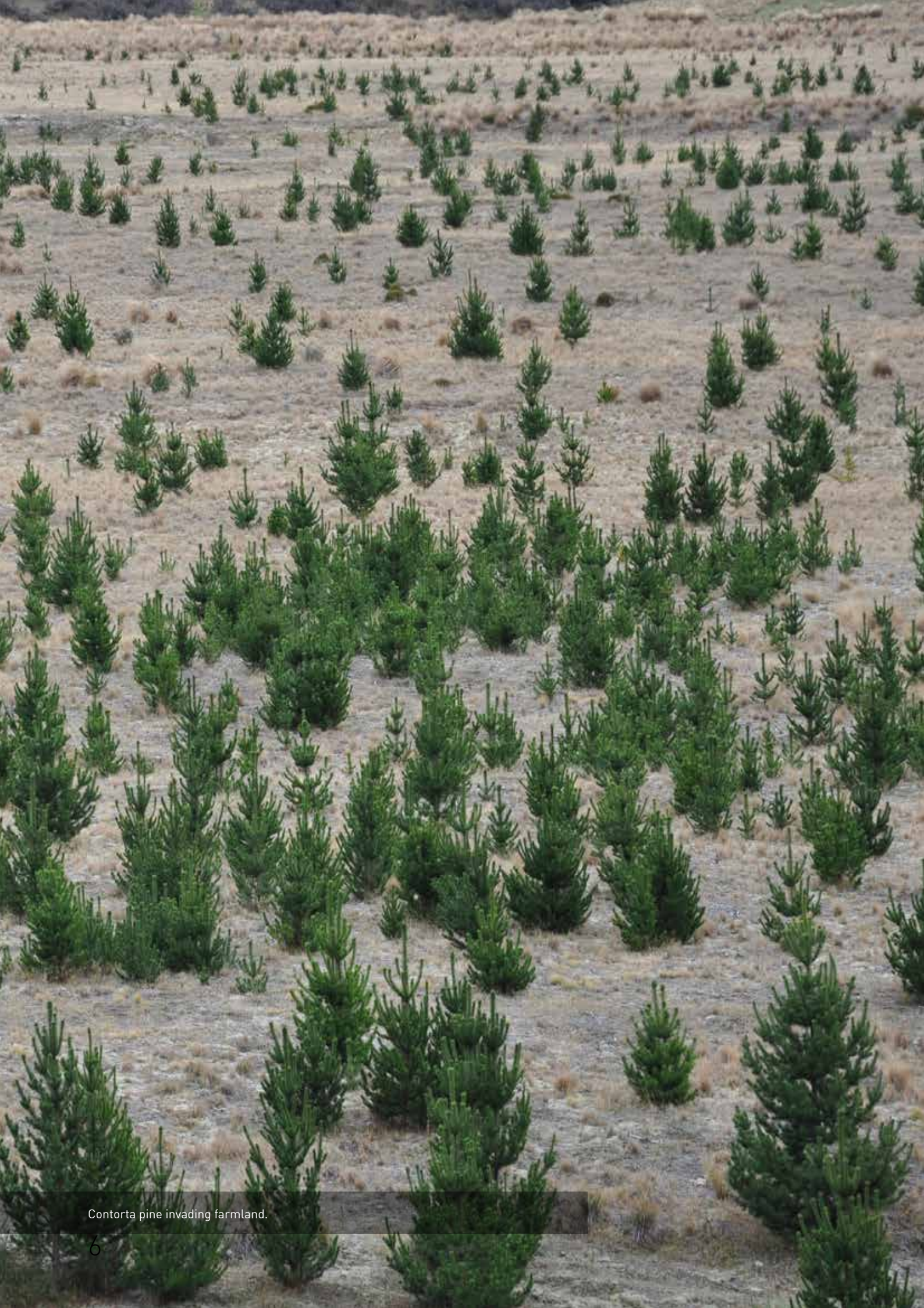
Contorta pine invading farmland.