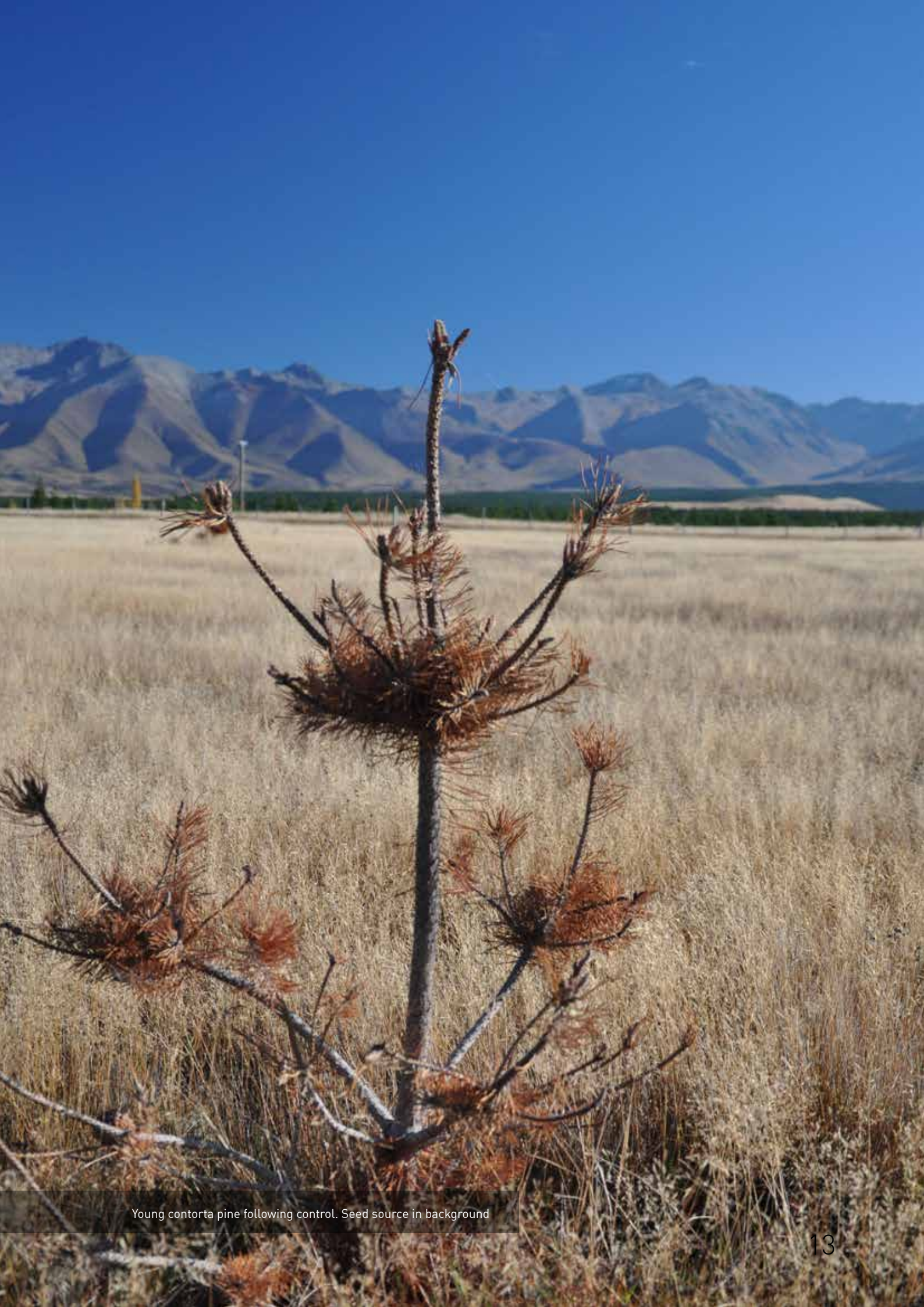
Young contorta pine following control. Seed source in background