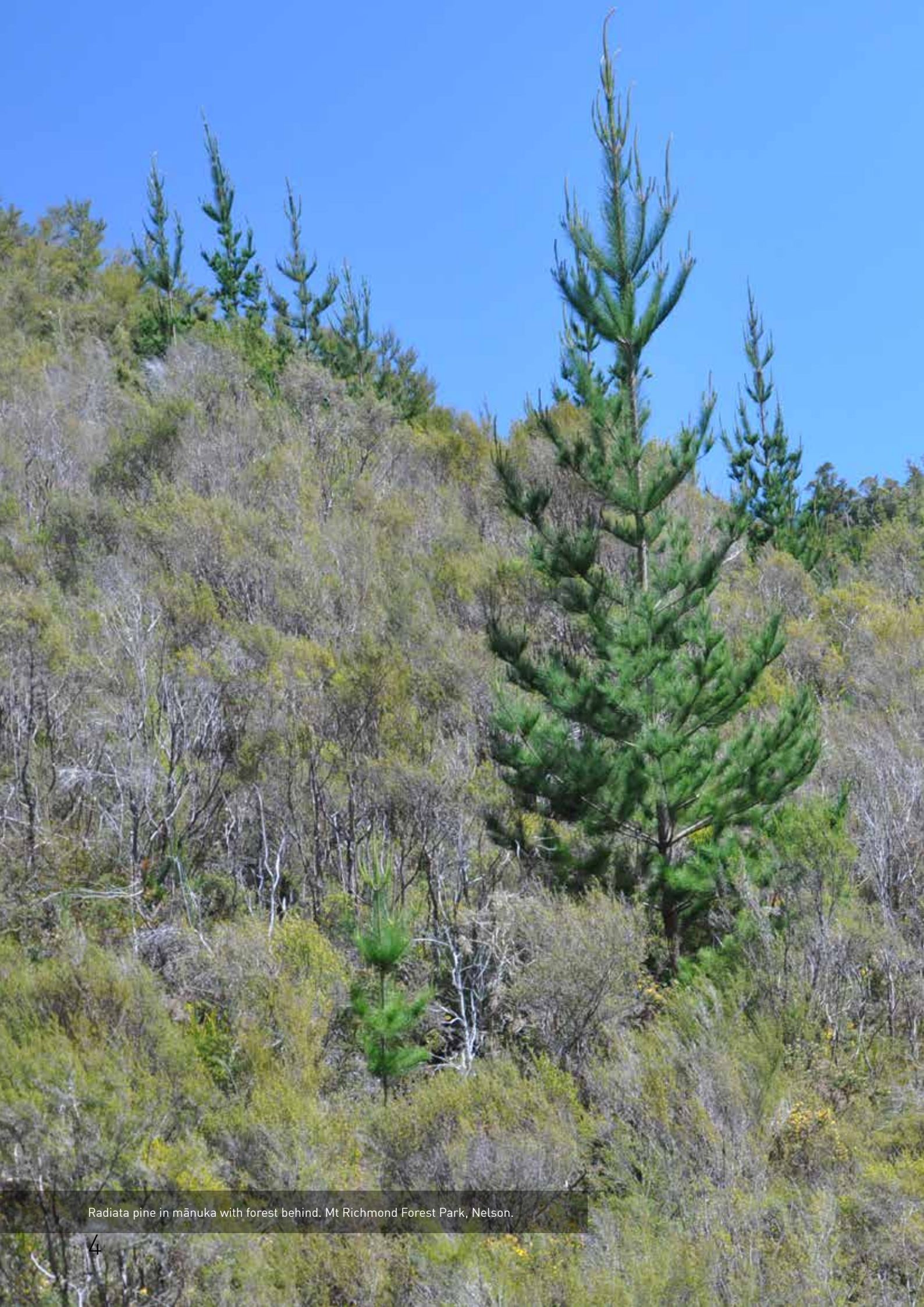
Radiata pine in mānuka with forest behind. Mt Richmond Forest Park, Nelson.