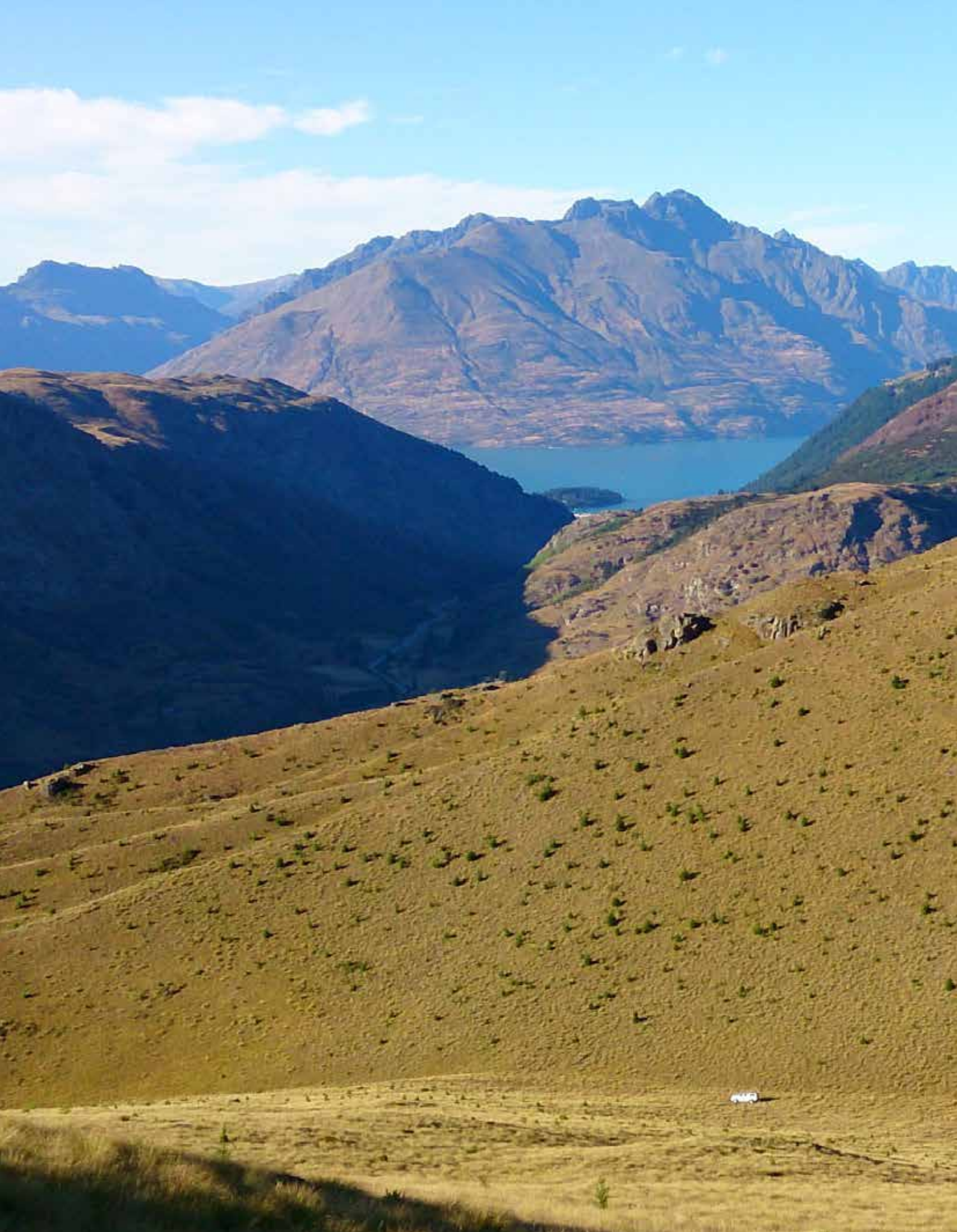
Early spread in tussock land. More established wilding conifers in background. Queenstown area