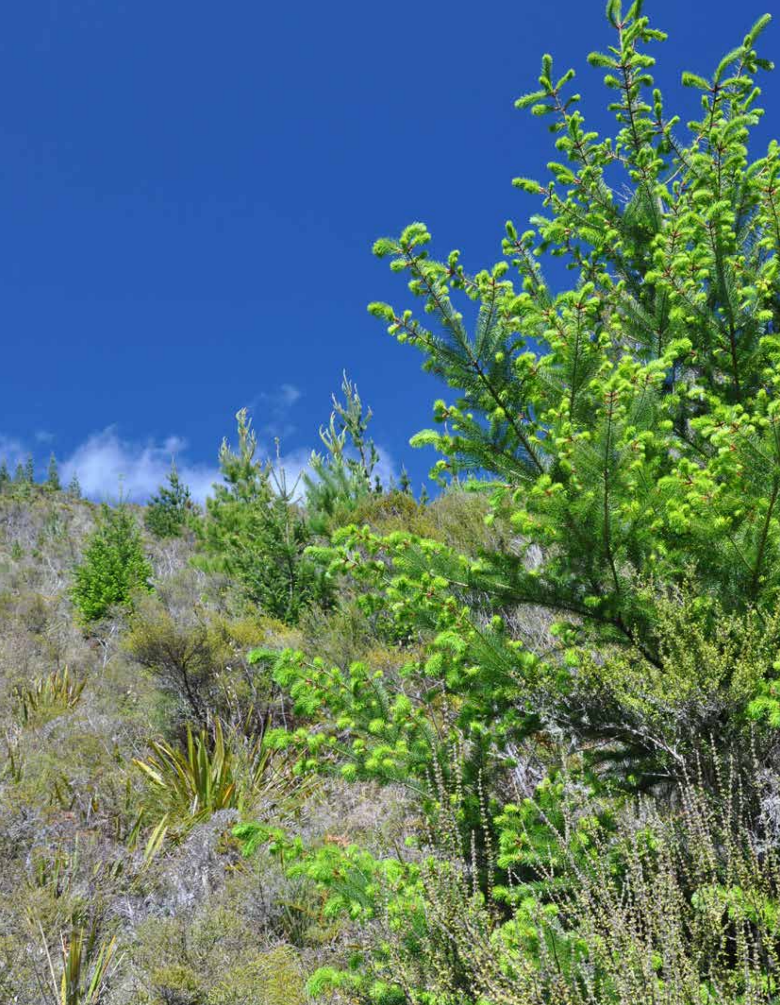
Douglas fir invading susceptible native shrubland. Mt Richmond Forest Park, Nelson