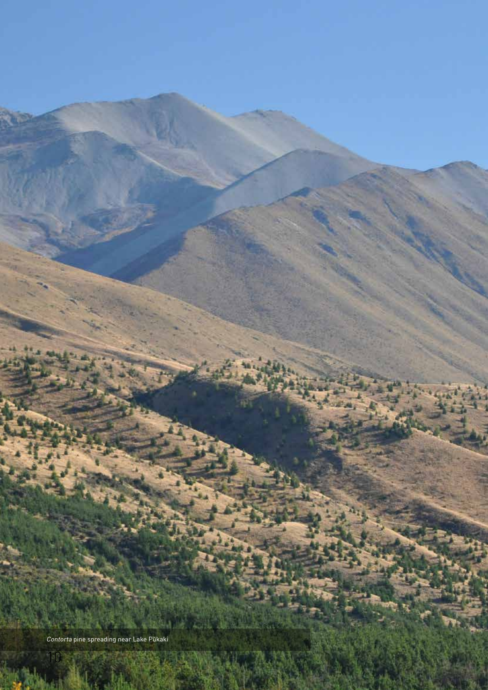
Contorta pine spreading near Lake Pūkaki